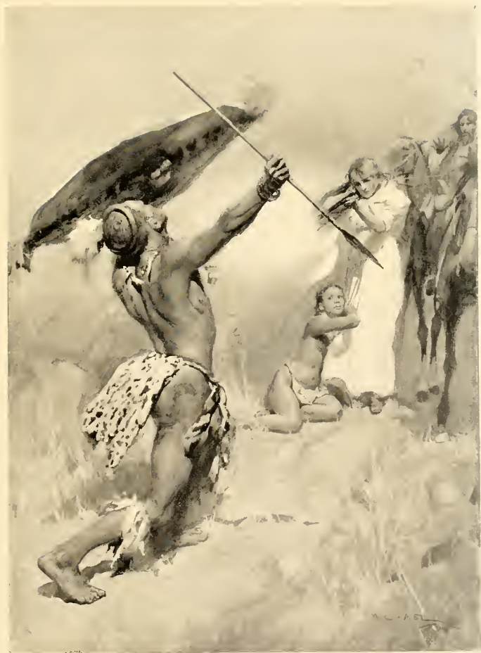
“The Zulu leapt into the air” (see page 59).